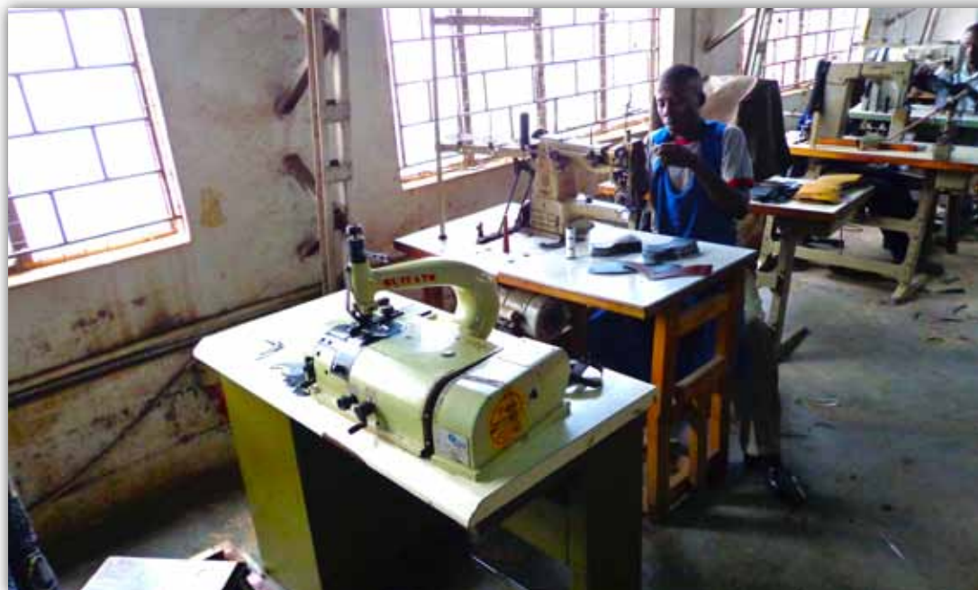
In 2032 MSME shall contribute at least 50% of manufacturing GDP in the EAC