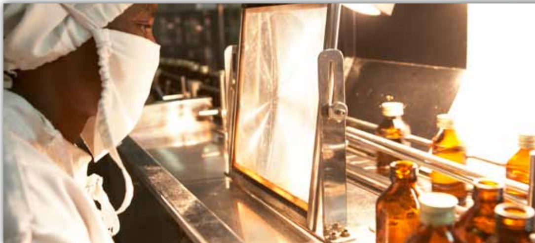
Pharmaceutical production is one of the six strategic regional industries of the EAC Industrialisation Policy

A center for the development of strategic regional industries/enterprises will be established to administer the scheme and promote targeted investments in the priority sectors.