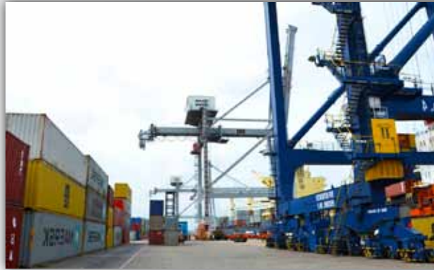
Loading of goods at a port in the EAC

The EAC Common Market Protocol was signed by the Heads of State in November 2009. Among other objectives, it focuses on: accelerating regional economic growth and development by enabling free movement of goods, persons and labour the rights of establishment and residence; and the free movement of services and capital.