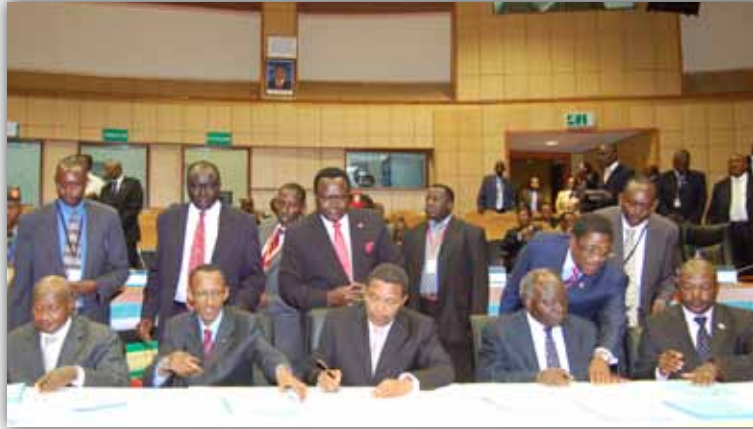
Regional cooperation essential for successful implementation of the EAC Industrialisation Policy

The overall policy guidance on industrial development in the region will be the responsibility of the Sectoral Council on Industrialisation (to be established). The Sectoral Committee on Industry will be the technical arm of the Sectoral Council. To ensure follow-up on the implementation of complementary policies and measures, an inter-ministerial coordination forum comprising of ministers responsible for implementing complimentary polices, and industrial development will be institutionalised to meet and make decisions on complementary measures affecting industrial development.