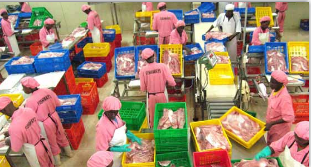
Local value addition in fish processing in the EAC