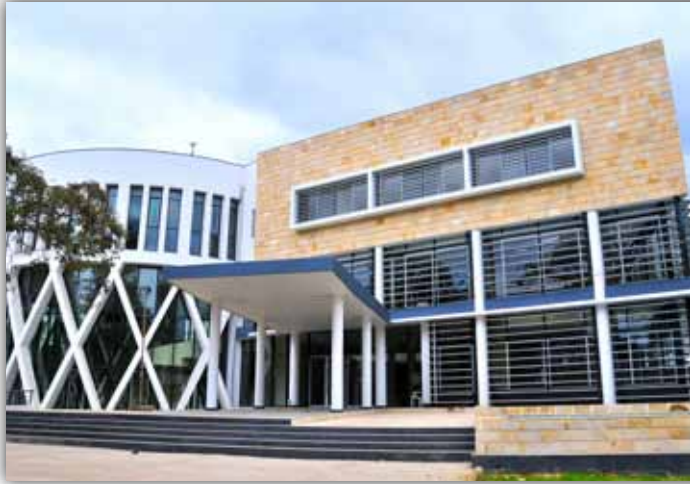
EAC headquarter in Arusha, Tanzania

National Governments are expected to ensure that national industrialisation policies and strategies are implemented, and that they are aligned with regional industrialisation initiatives. The Partner States are also expected to work in tandem with the private sector to initiate, implement, and monitor national industrial development policy interventions that reinforce regional industrialisation efforts.