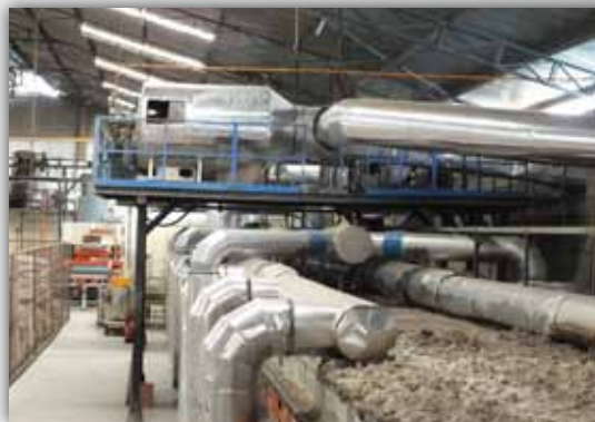
Diversifying the manufacturing base through cement production