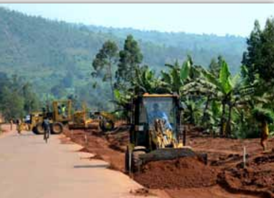
Infrastructure development key for success of the EAC Industrialisation Policy

Industrialisation policies are likely to be ineffective in the absence of complementary policies that support their objectives such as infrastructure (road and rail networks, energy etc.) or macro-economic factors (interest rates, exchange rates, fiscal and non-fiscal incentives etc). In particular, access to quality and affordable energy supply is a pre-condition for industrialisation which should be addressed concurrently as industrialisation programmes are implemented. The manufacturing sector alone is a major user of energy (electric power), consuming over 60 percent of total energy production. The planning for energy expansion should therefore take into account the manufacturing sector requirements for energy in terms of quantity, quality and price.