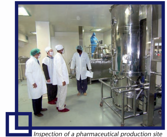
Inspection of a pharmaceutical production site